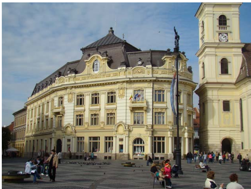
Sibiu – The City Hall

Sibiu is beautiful; it is a delight for the eyes. Even if someone comes to Sibiu for the tenth time, the medieval burgh seems to always have a surprise for the visitor, something that remained unobserved the last time due to the glances "caught" by other beauties: churches, walls, museums, philharmonic, theatres, a good selection of restaurants, pavement cafés and beer gardens.