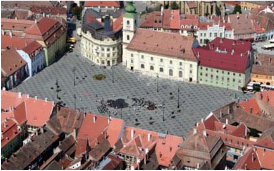
Sibiu – The Large Square

Sibiu city ( Hermannstadt ) is situated in the middle of the country, at the crossing points between the 45°47' Northern latitude parallel and the 24°05' Eastern longitude meridian, where the roads of the historical Romanian areas meet. It is also a junction for the spreading of material and spiritual values, which created a blossoming culture and civilization.